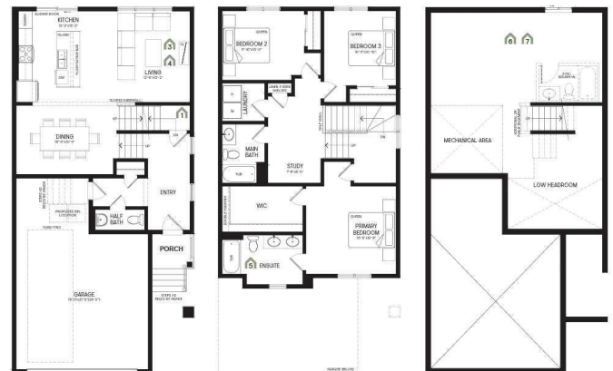
Main floor 707 sq ft.