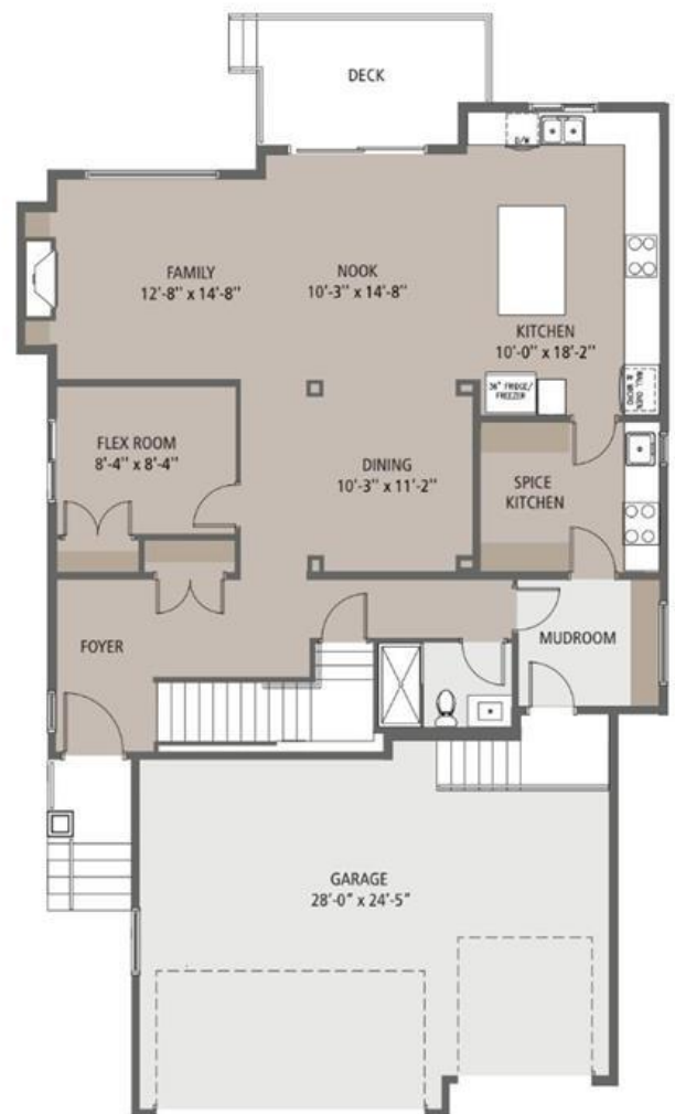
MAIN FLOOR: 1353 SQ.FT